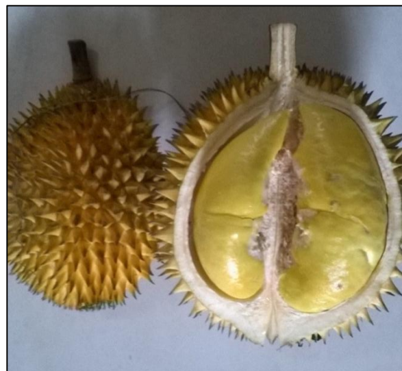
Figure 4. Fruit and aryl of Lai Durian No. 3 Loa Kulu

The tree was up to 9 m tall. Fruits color is orange-yellow, globose with conical spine shape, had a clear segment line, strong aroma, ripe on the tree, and fallen upon maturity, sweet flesh taste with medium seed size. Leaves alternate, elliptical, or lanceolate-elliptical. This fruit was one of the fruits chosen as one of the crosses of D. Zibenthinus x D. Kutejensis potentially superior to Loa Kulu and named as Lai Durian Loa Kulu No. 3.