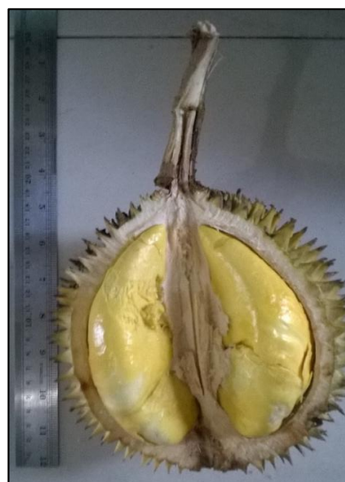
Figure 7. Fruit and Aryl of Lai Durian No. 6 Loa Kulu

Lai Durian No. 6 Loa Kulu tree was up to 10 m tall. Fruits color was greenish-yellow with obovoid fruit shape, had conical spine shape, a clear segment line, moderate aroma, ripe on the tree, and fallen upon maturity, sweet thick flesh, with medium seed size, leaves alternate, elliptical or lanceolate-elliptical. This fruit was one of the fruits chosen as one of the crosses of D. Zibenthinus x D. Kutejensis potentially superior to Loa Kulu and named as Lai Durian Loa Kulu No. 6.