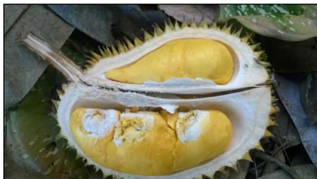
Figure 2. Aryl of Lai Durian Loa Kulu No. 1