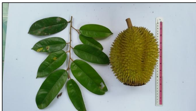
Figure 1. Fruit and Leaf of Lai Durian Loa Kulu No. 1