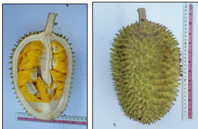
Figure 3. Fruit and Aryl of Lai Durian Loa Kulu No. 2

The tree was up to 10 m tall. Fruits color was greenish-yellow, oblong with concave spine shape, had a clear segment line, mild flesh aroma, ripe on the tree and fallen upon maturity, sweet flesh taste, with small seeds, Aryl arranged stacked with each other. Leaves alternate, elliptical, or lanceolate-elliptical. This fruit was one of the fruits chosen as one of the crosses of D. Zibenthinus x D. Kutejensis potentially superior to Loa Kulu and named as Lai Durian Loa Kulu No. 2.