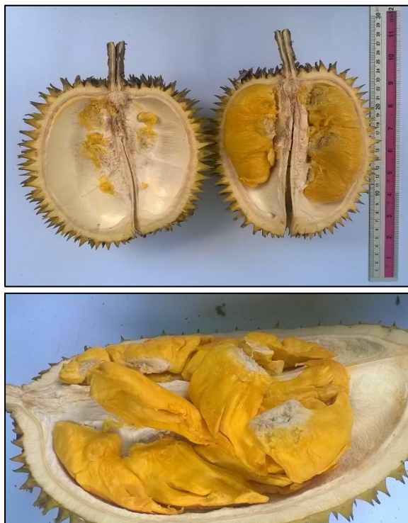
Figure 6. Fruit and Aryl of Lai Durian No. 5 Loa Kulu

The tree was up to 10 m tall. Fruits color was greenish-yellow, globose with conical spine shape, had a clear segment line, strong flesh aroma, ripe on the tree and fallen upon maturity, and sweet flesh taste leaves alternate, elliptical or elliptic-oblong. This fruit was one of the fruits chosen as one of the crosses of D. Zibenthinus x D. Kutejensis potentially superior to Loa Kulu and named as Lai Durian Loa Kulu No. 5.